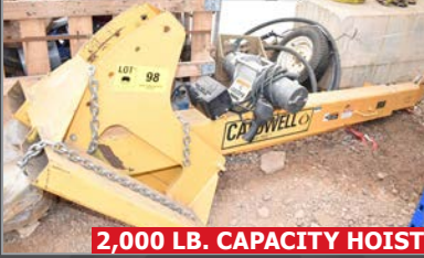
2,000 LB. CAPACITY HOIST

FLAGLER 14000 standard pittsburgh machine