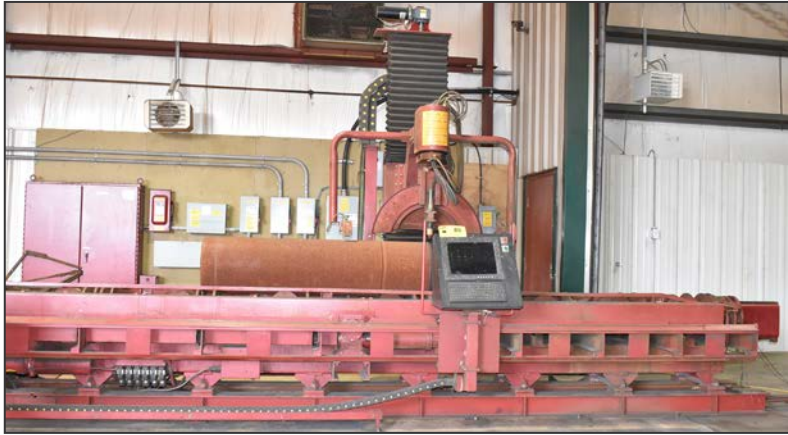
VERNON MPM5-0348/40FT 5-AXIS CNC pipe cutting & profiling machine