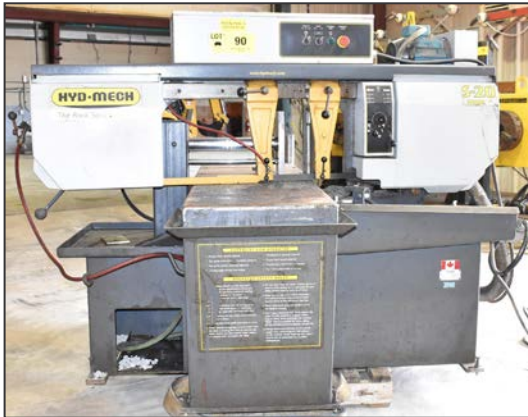
HYD-MECH S-20 horizontal metal cutting bandsaw