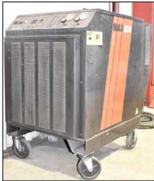
HYPERTHERM MAX200 plasma cutting system