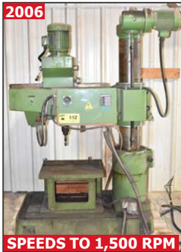
2006 TAILIFT 820A 4' radial arm drill SPEEDS TO 1,500 RPM