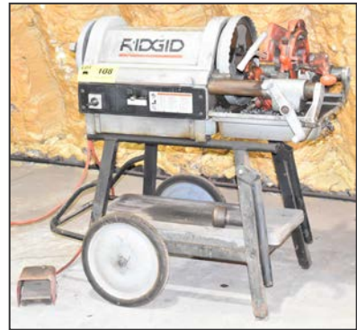
RIDGID 1224 pipe threading machine