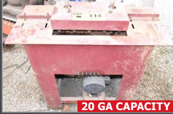
20 GA CAPACITY

KING INDUSTRIAL BB-4022 combination shear, brake & roll