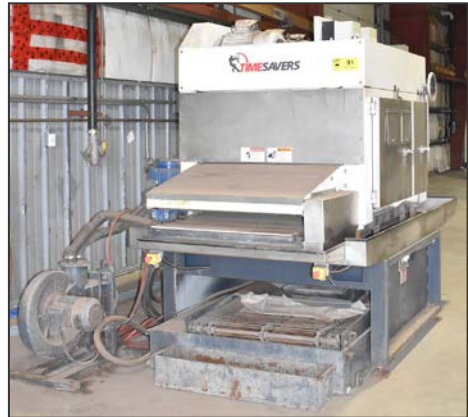
TIMESAVERS LYNX 37MWT-DDB-60 37" X 60" wide belt sander