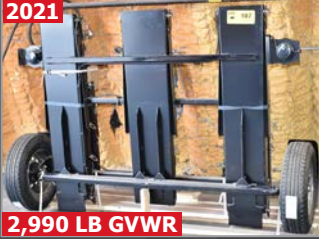
2,990 LB GVWR

CANADIAN TRUCK & TRAILER INC. STINGER FOR CAN-AM trailer