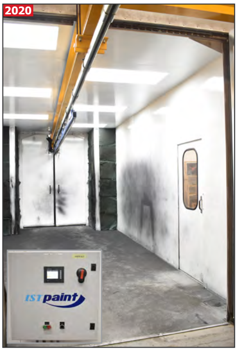
Interior of IST PAINT paint booth