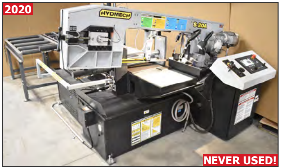
HYDMECH S-20A automatic horizontal pivot band saw