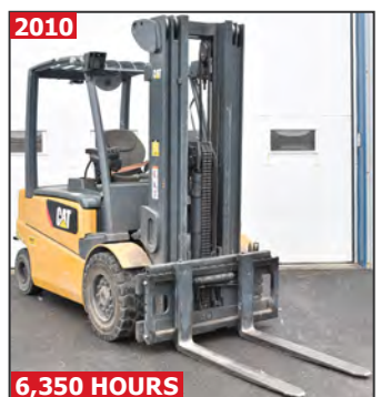
JUNGHENREICH EP8000 5,700 lb