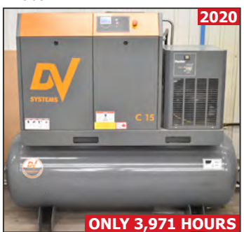
DV SYSTEMS C15TD 15 HP tankmounted rotary screw air compressor