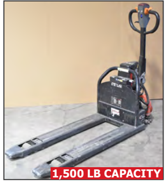
HELI 24V electric walk-behind pallet truck

DV SYSTEMS C15TD 15 HP tank-mounted rotary screw air compressor