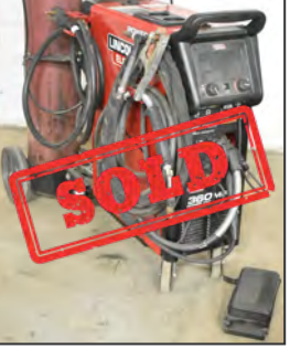
LINCOLN ELECTRIC POWER MIG 360MP multi-process welder