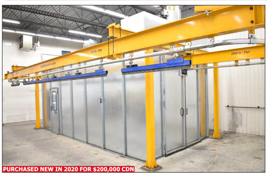
IST PAINT 288"x138"x120"H free standing bolt-together through type paint booth with SMAK MANUTENTION monorail overhead conveyor