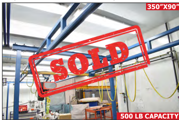
GORBEL free standing gantry system