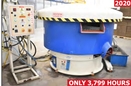
ROYSON 20CTV-IS automatic vibratory finishing machine with chemical dosing system

DAVI MCA2017 CNC 4 roll plate bending machine