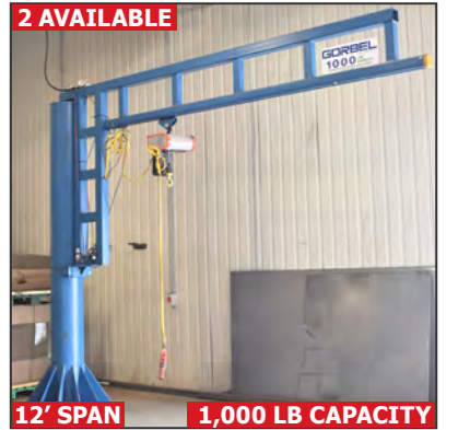
GORBEL free standing jib arm