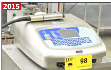
2015 LINX 5900 ETHR digital inkjet coder