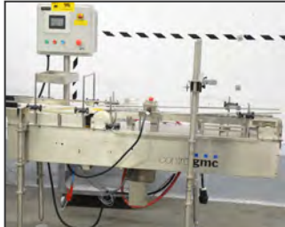
Control GMC motorized conveyor filler station