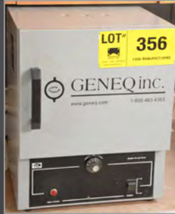
GENEQ INC MODEL 10 electric lab oven