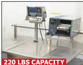
220 LBS CAPACITY RICE LAKE IQ+355-2A digital bench scale