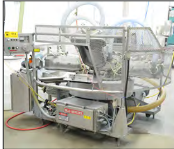
CRYOVAC OLD RIVERS 8610-14 rotary chamber vacuum packaging machine