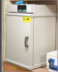
FISHER SCIENTIFIC ISOTEMP digital lab incubator