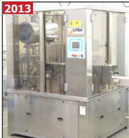
2013 ILPRA fill seal 7000E rotary type filling & sealing machine