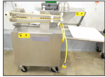
HANDTMANN 216-01/814 portable stainless steel link cutter

CONTACT 416.962.9600 TO CONSIGN EQUIPMENT AT AN UPCOMING AUCTION