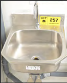
Partial view of stainless steel sinks available