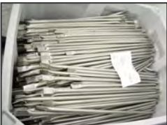
Partial view of stainless steel hanging rods available