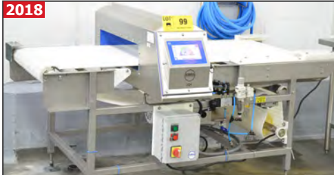
2018 LOMA IQ4 automatic in-line through type metal detector conveyor