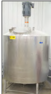
ROTOSTART stainless steel mixing tank