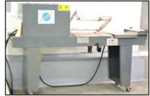
SATURN ALPHA C3.5E combination l-bar sealer, heat shrink tunnel