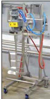
ARBT-ARO portable mixer agitator