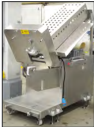
DIXIE UNION nova slicer heavy duty slicer