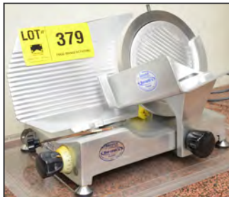
RHENINGHAUS bench type slicer