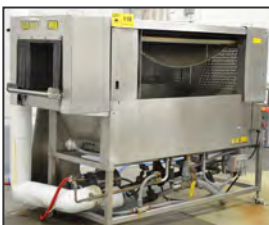
ATHENA stainless steel through type steam tunnel washer