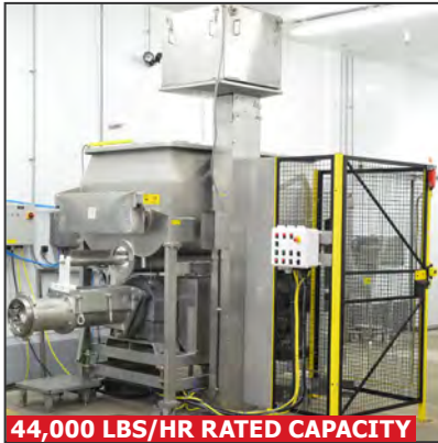
44,000 LBS/HR RATED CAPACITY