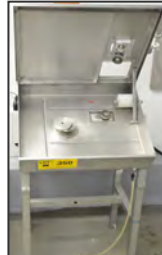
Slicer blade sharpener grinder