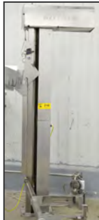
KITTNER vertical trolley bin tipper