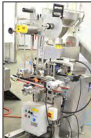
D.L.-TECH HERMA label applicator