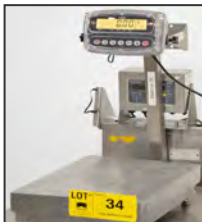
CARDINAL STORM 190 digital bench scale