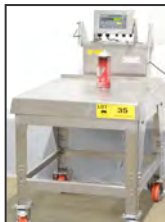
WEIGH-TRONIX WI-125 digital scale