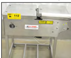
Cryovac bag dispenser opener