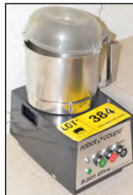
ROBOT COUPE R301 heavy duty chopper