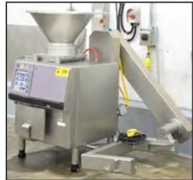
HANDTMANN VF 300B automatic vacuum filler/stuffer