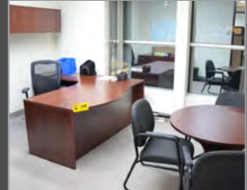
Partial view of office furniture available

ALSO: (3+) stainless steel industrial boot cleaners; (100+) 200 liter capacity stainless steel trolley bins; (75+) stainless steel rolling racks; (300+) stainless steel molds with lids; (10+) stainless steel pallet trucks; (30+) sections of stainless steel and conventional adjustable pallet racking; factory support equipment including ladders, stainless steel steps and platforms, racks, bins, sanitation supplies, stainless steel sinks throughout plant, selection of spare parts and changeover tooling; lab and test kitchen equipment including FISHER SCIENTIFIC digital incubator, DUPONT bacterial test system, balance scales, hand slicers, meat grinders, sausage stuffers and hand tools; large selection of quality designer office furniture comprising executive desks and chairs, boardroom with leather chairs, modular workstations, file cabinets and MUCH MORE!