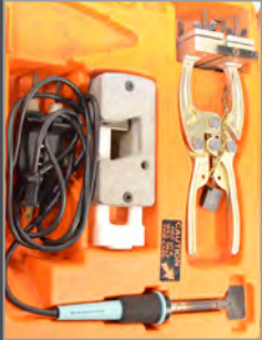
ALLIGATOR FLEX electric conveyor belt splicing kit

Tuesday, August 8 Blainville, Quebec, Canada