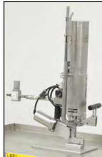
TIPPER TIE throat actuated pneumatic clipper