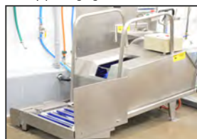
Stainless steel industrial boot wash station