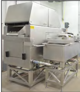
KAUFLER high speed dual head brine injector tenderizer