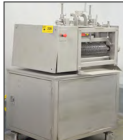
MEPSCO HI PRO macerator/slicer/deboner