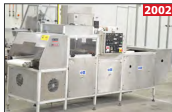
2002 ROSS INDUSTRIES INPACK A20 automatic pre-formed tray packaging machine