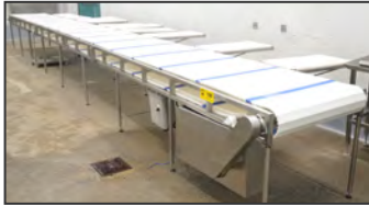
S.E.C 36" X 36' motorized sanitary food grade table conveyor