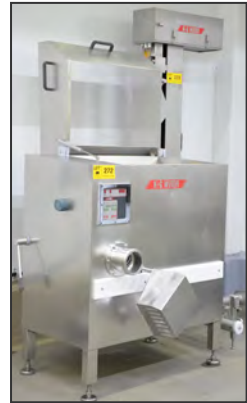
K+G WETTER 419 stainless steel mixer grinder