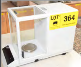
METTLER TOLEDO AE 200-S digital balance scale