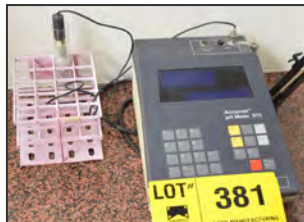
FISHER SCIENTIFIC ACCUMET 915 digital PH meter

CONTACT 416.962.9600 TO CONSIGN EQUIPMENT AT AN UPCOMING AUCTION