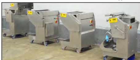
View of GRASSELLI & BRITT membrane skinner/derinders available