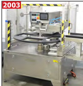
2003 ILPRA food pack FP800 V/G rotary type tray sealer machine