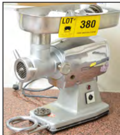
OMEGA heavy duty meat grinder