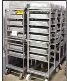
Partial view of stainless steel track racks available