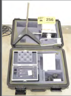
AMETEK BROOKFIELD RV viscometer set