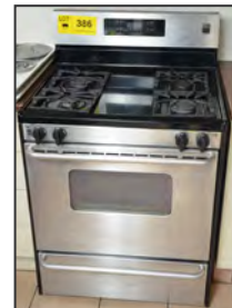
FRIGIDAIRE gallery gas stove

TO SCHEDULE AN AUCTION CONTACT 416.962.9600