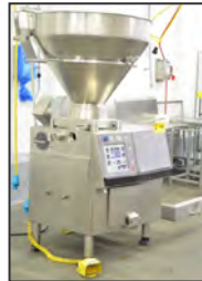
HANDTMANN VF 200 vacuum filler/stuffer