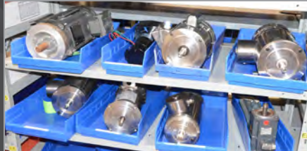
Partial view of electric motors available