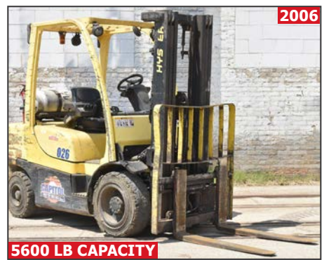
HYSTER H60FT LPG forklift

CONTACT 416.962.9600 TO CONSIGN EQUIPMENT AT AN UPCOMING AUCTION