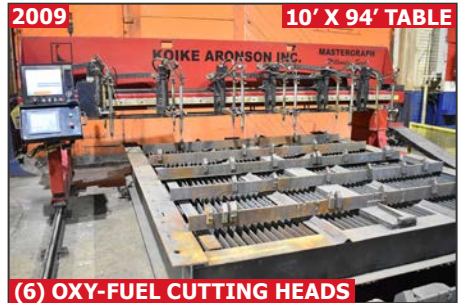
KOIKE ARONSON MASTERGRAPH MILLENIUM SERIES MGM3100 CNC gantry-type oxy-fuel burning table

FICEP TIPO-B25 flexible CNC steel plate processing center