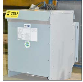
DELTA 45 KVA transformer