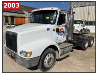
INTERNATIONAL 9400I tandem axle semi tractor