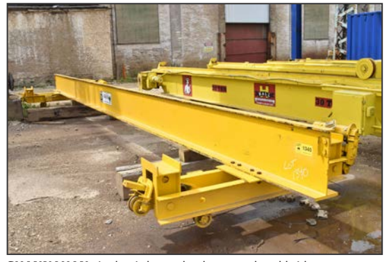
SHANNAHAN single girder underslung overhead bridge crane