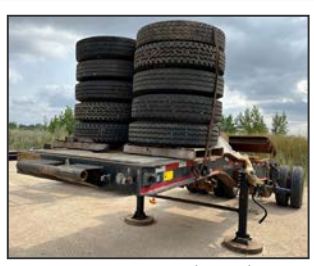
MFG. UNKNOWN tandem axle 16-wheel jeep