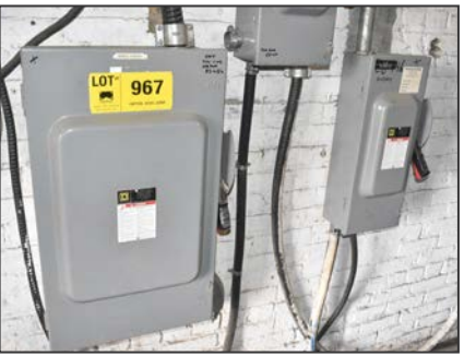
Partial view of SQUARE D electrical shut off switches available