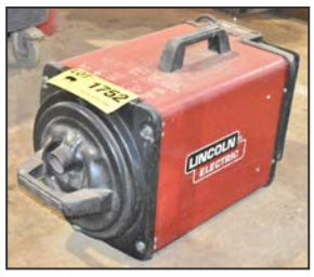
LINCOLN electric portable vacuum extraction unit