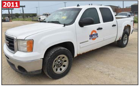
GMC SIERRA 1500 4-door pickup truck