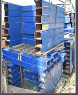
Partial view of heavy duty capacity modular support system

ALSO: LIFTING ACCESSORIES – including lifting slings, spreader beams, sheet & plate lifters; CAT 40 & CAT 50 tool holders, steel work benches and bins, welding consumables, oxy-acetylene hose with gauges & torch, welding cables, portable gas-powered generators, adjustable pallet racking, scaffolding, 600V/480V 3ph 50 Amp step-down transformers, self-dumping hopper, paint pumps & sprayers, paint drying racks, roller conveyor – various sizes & lengths, trailer jacks, air conditioners, office furniture, dry erase boards and MORE!