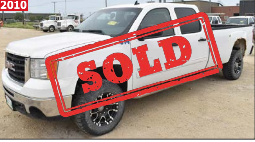
GMC SIERRA 3500HD 4-door pickup truck