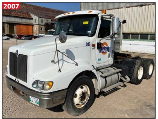
INTERNATIONAL 9400I tandem axle semi tractor