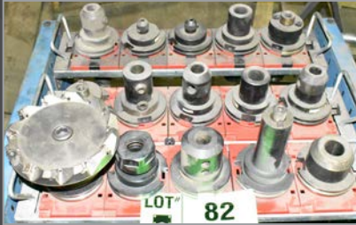
Partial view of CAT 40/50 & BT 40 taper tool holders available