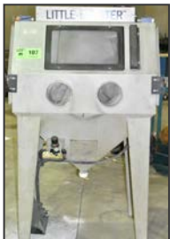
LITTLE BLASTER sandblast cabinet