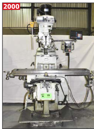
MANFORD SP-460FVS vertical turret milling machine