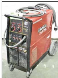
LINCOLN ELECTRIC 256 digital MIG welder