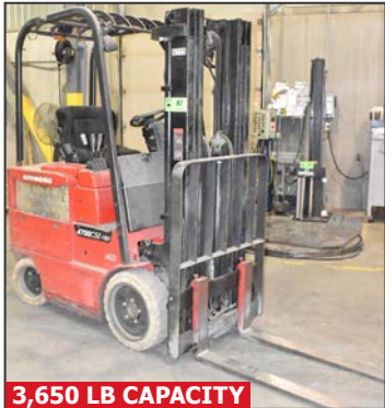
3,650 LB CAPACITY RAYMOND indoor electric forklift