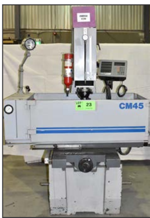
CORISMA MACHINE TOOL OMEGA CM45 sinker type EDM