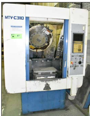
MIYANO MECTRON MTV-C310 CNC drill and tap center