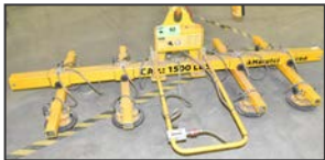
SMACK MANUTENTION suction cup vacuum lifter