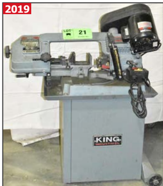
KING INDUSTRIAL KC-129DS 5" x 6" dual swivel horizontal bandsaw