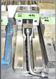
Partial view of machine vises