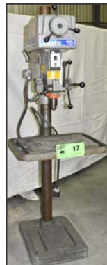
CLAUSING 1767 15" drill press

CONTACT 416.962.9600 TO CONSIGN EQUIPMENT AT AN UPCOMING AUCTION