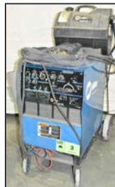
MILLER SYNCWAVE 250 TIG welder