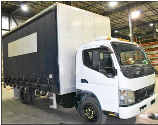
MITSUBISHI FUSO, dually box truck