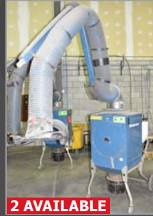
2 AVAILABLE NEDERMAN portable fume extraction unit