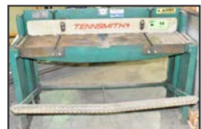
TENNSMITH T52 52' foot shear