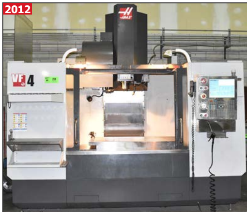
HAAS VF4, CNC vertical machining center