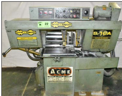
HYD-MECH S-10A, horizontal saw