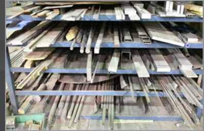
Partial view of tube & sheet stock materials

FEATURED: HAAS (2012) VF4, CNC VMC w/ RENISHAW probe system; HAAS (2005) EC 300, high-speed CNC twin pallet HMC w/ 12,000 RPM, through spindle coolant, inline direct-drive spindle, etc.; HYD-MECH S-10A, horizontal saw; MITSUBISHI FUSO, dually box truck w/roll-up side curtain; HYSTER indoor LPG forklift; RAYMOND indoor electric forklift; SKYJACK SJIII 4830, electric scissor lift; LINCOLN ELECTRIC high volume fume extraction system; (2) NEDERMAN portable fume extraction units; LARGE ASSORTMENT OF perishable tooling, machine tool accessories, precision inspection equipment, late model LINCOLN welders, general machining equipment, raw material & sheet stock inventory, factory support equipment & MORE!