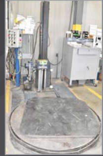
ORION PACKAGING l66/5 pallet wrapper