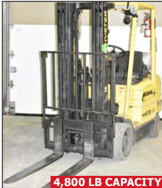
4,800 LB CAPACITY HYSTER indoor LPG forklift