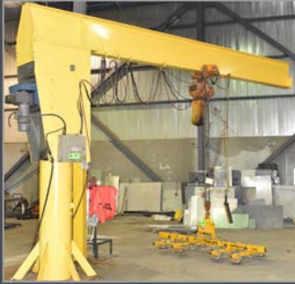
MFG UNKNOWN jib crane