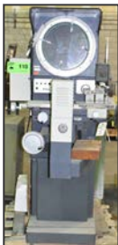
NIKON R-14 profile projector