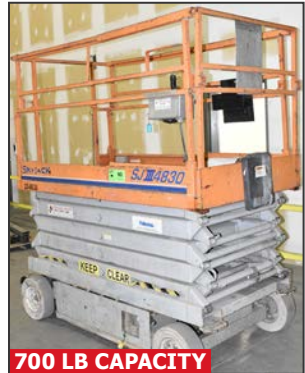
700 LB CAPACITY SKYJACK SJIII 4830 electric scissor lift