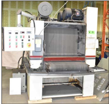
MIDWEST SANDRIGHT PFA-160 2-head belt sander