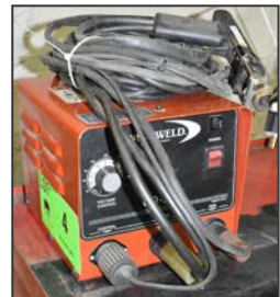
NELSON FASTENER SYSTEMS stud welder