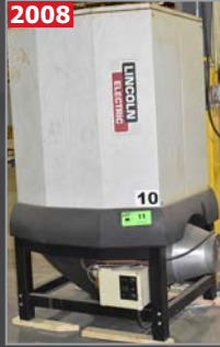
2008 LINCOLN ELECTRIC 6000MS smoke extractor