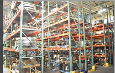
Partial view of coil material available

ALSO: (20+) PA INDUSTRIES & DURANT power & pull-thru straighteners; (4) KURT 6" machine vises; SYSTEM 3R EDM tooling; (15+) LISTA style tool cabinets; work tables; heavy duty steel work benches; granite surface plates; LARGE OFFERING (over 500,000 lbs!) of coil material and spring wire including HIGH CARBON STEEL, STAINLESS STEEL & GAVINZED STEEL; (3) double end pedestal grinders; a-frame & extension ladders; hydraulic pallet jacks, rolling shop ladders, fireproof cabinets; collapsible wire mesh bins; steel parts bins, (2) 40' storage containers; shop fans; ZEBRA label printers; (20+) heavy duty steel storage racks with 2,000 lb. -15,000 lb. per shelf capacities; (150+) sections of adjustable pallet racking; 5C milling collets; grinding wheels; HUGE SELECTION OF STAMPING & PUNCHING DIES; servers & components; office furniture & MORE!