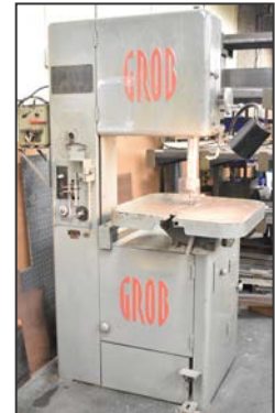
GROB NS18 vertical band saw