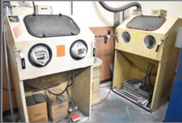
EMPIRE EF-2436 ECONO-FINISH sand blast cabinets