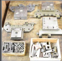
Partial view of System 3R EDM tooling available