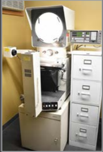
MITUTOYO PH-3500 14" optical comparator