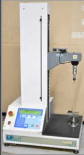
Digital bench-type tensile tester