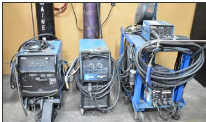
MILLER welders available

TO SCHEDULE AN AUCTION CONTACT 416.962.9600