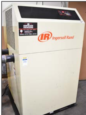
INGERSOLL-RAND NVC600A400 refrigerated air dryer