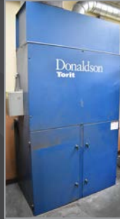
Cartridge-type dust collector