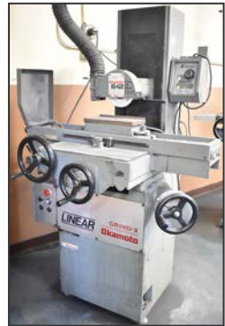
OKAMOTO L6-12B conventional surface grinder