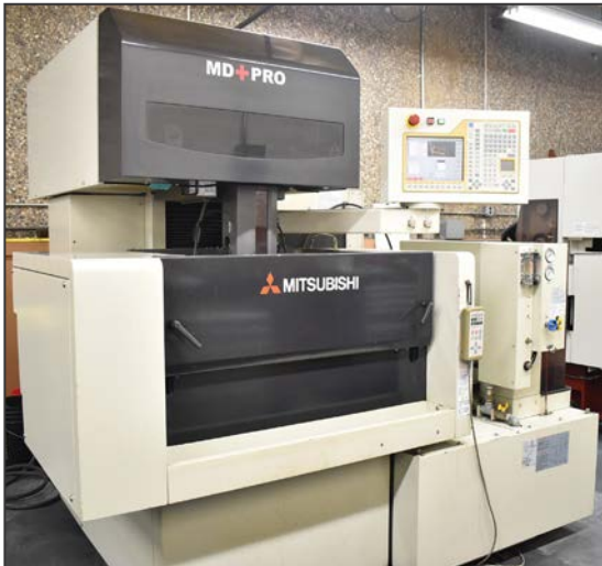
MITSUBISHI FA10MD CNC wire EDM