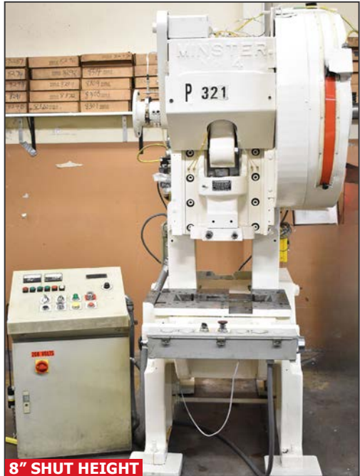
MINSTER NO. 7 75 ton capacity mechanical OBI punch press