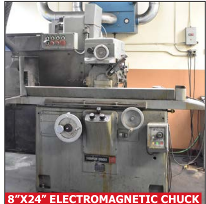
8"X24" ELECTROMAGNETIC CHUCK