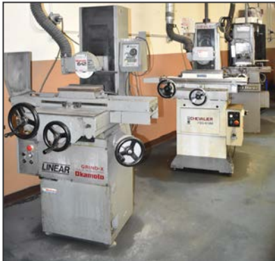
Partial view of surface grinders available