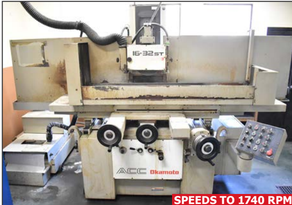
SPEEDS TO 1740 RPM