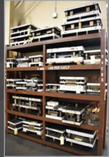
Partial view of press dies available