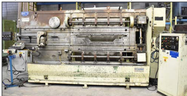
OMCG MODEL 1400 MULTISLIDE wire forming machine