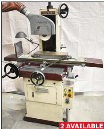
CHEVALIER FSG-618M surface grinder