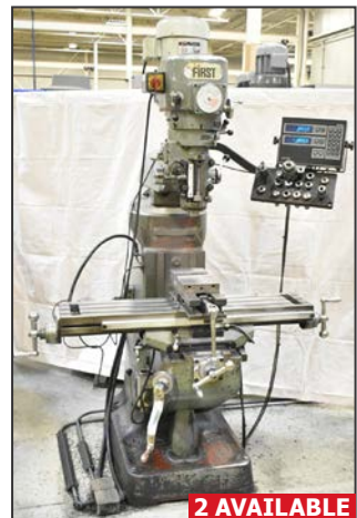
FIRST LC1 1/2 VS universal mill