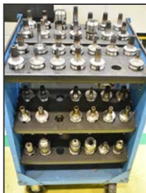
Partial view of toolholders available