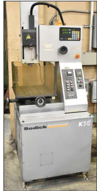
SODICK K1C small hole drilling EDM