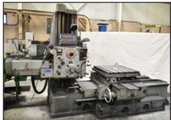
TOS WH63 horizontal boring mill