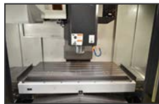
Interior view of AWEA vertical machining center