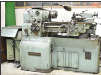
MONARCH 10BE tool room lathe