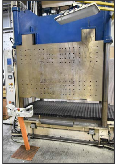
View of tilting platen