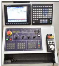
Interior view of AWEA CNC