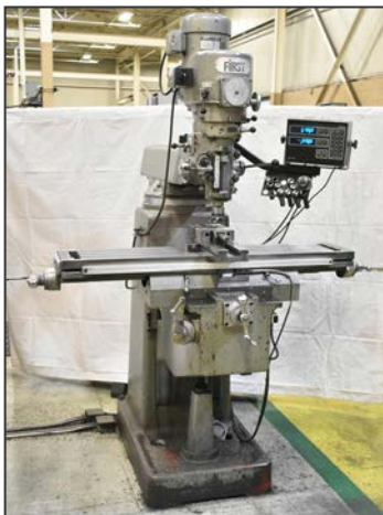
FIRST LC135VS universal mill