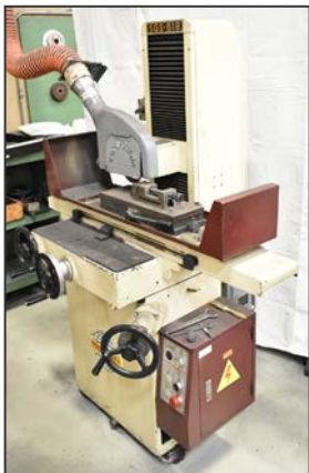
FREEPORT 5GS-618 surface grinder