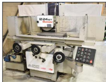
OKAMOTO 12-24ST hydraulic surface grinder