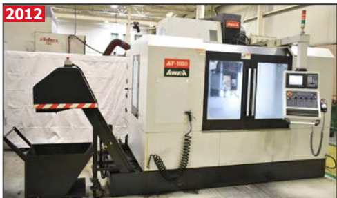
AWEA AF-1000 CNC vertical machining center

TO SCHEDULE AN AUCTION CONTACT 416.962.9600