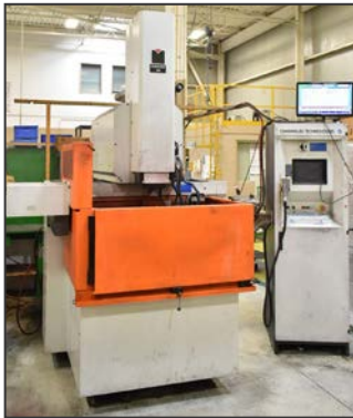
CHARMILLES ROBOFORM 50 CNC sinker type EDM