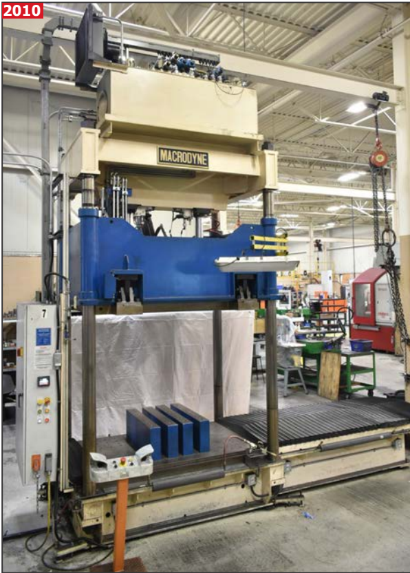
MACRODYNE MPS-50 50 TON 4 post hydraulic spotting press