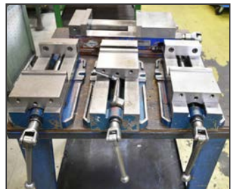
Partial view of machines vises available