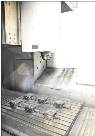
Interior view of RODERS vertical machining center