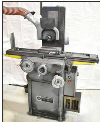
RICH BROTHERS HA surface grinder