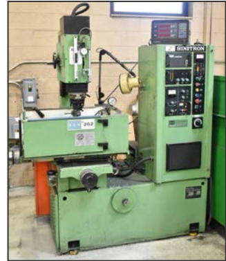
SINTRON ED252 sinker type EDM