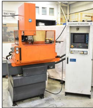
CHARMILLES ROBOFORM 20 CNC sinker type EDM