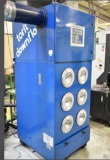
TORIT MODEL SDF6 10HP 6 bag dust collector

ALSO: Huge quantity of perishable tooling, BT40 tool holders, machine vises, standard vises, indexing heads, magnetic base plates, inspection equipment, granite surface plates, workbenches, tool boxes, shelving units, die carts, hardware, office furniture and MUCH MORE!