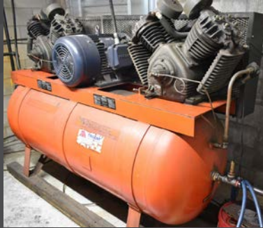
DEVILBISS 25HP air compressor