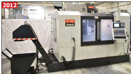
AWEA AF-1000 CNC vertical machining center