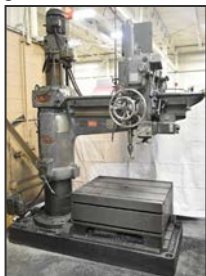
ASQUITH ODI 4' radial arm drill