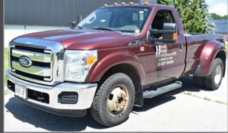
FORD F350 XLT pick up truck