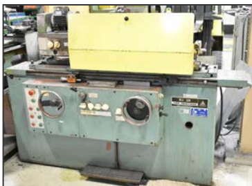
TOS BU28 universal cylindrical grinder