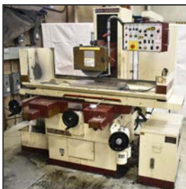
CHEVALIER FSG-3A1224H hydraulic surface grinder