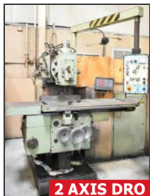
TOS KURIM FGSV32 universal mill