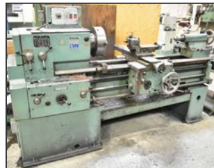
TOS SN50B engine lathe