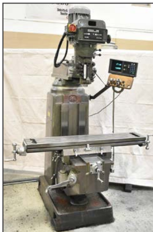
LILIAN 11307 universal mill