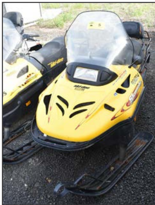
SKI-DOO SCANDIC snowmobile