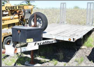
EXCALIBUR 15' t/a trailer