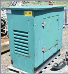
NEWAGE diesel generator