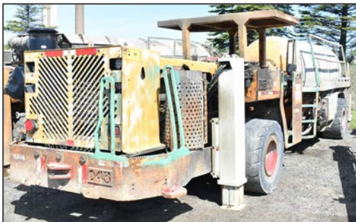
BTI ST-6M transmixer