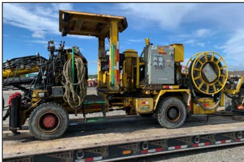
ATLAS COPCO BOOMER 281 jumbo drill rig