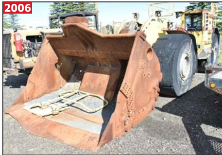
ATLAS COPCO ST14 scoop tram