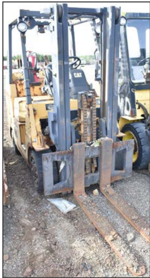
CATERPILLAR GC45K lpg forklift