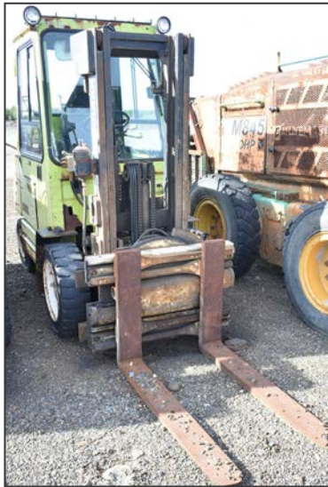
CLARK GP530C lpg forklift