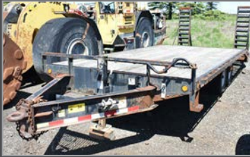
LOADMAX t/a 18' flat deck trailer