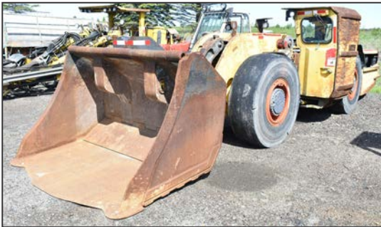
ATLAS COPCO ST7 scoop tram