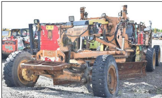
MINEMASTER M84D grader