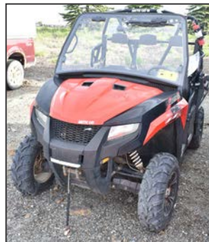
ARCTIC CAT side by side

TO SCHEDULE AN AUCTION CONTACT 416.962.9600