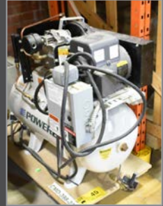
POWEREX tankmount compressor & dryer

FEATURING: (2) BTI TRANSMIXER underground cement trucks; (8) CANUN underground drills; ATLAS COPCO underground jumbo drill; ATLAS COPCO ST14, underground scooptram; CASE 845D motor grader; BOBCAT skidsteer; WACKER NEUSON portable light tower; (4) Outdoor Forklifts; (5+) Snowmobiles, ATVs & Boats etc.; (2) ARGO 8x8 TITANS ; ASSORTMENT OF MRO SPARES, dedicated machine accessories, vehicles, electrical infrastructure assets & MORE!