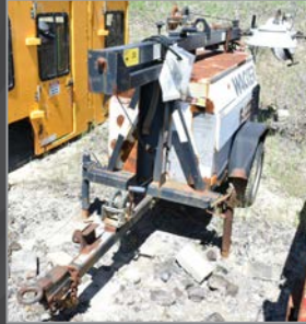
WACKER LTC4 tow behind light tower