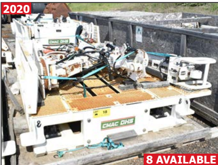
CMAC-THYSSEN DHS drill platform