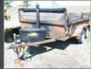
ADVANCE t/a 12' dump trailer