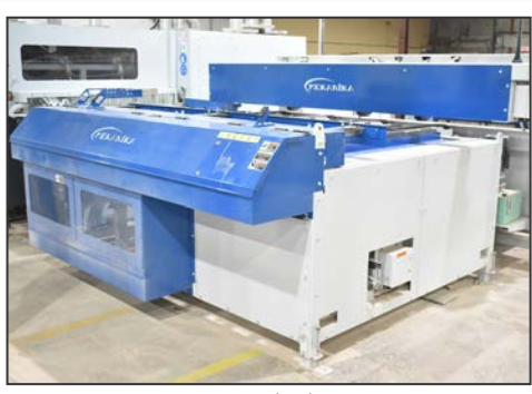
MEKANIKA NG-002 vacuum loader