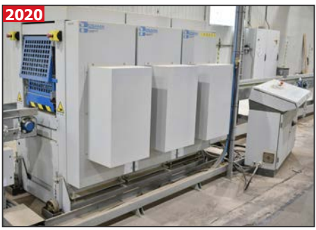
OSAMA CLR-M3-400 3-section automatic rotary laminator/calender sheet roller press