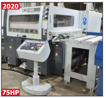
CANTEK LMC-1600MM 63" HD panel multiple rip saw