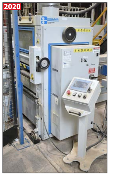
OSAMA GSHM-3-400 hot melt roller coater