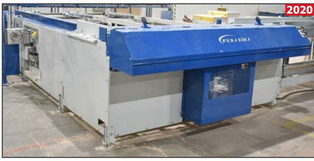
MEKANIKA GSHM-3-400 engineered floorboard top-layer positioner