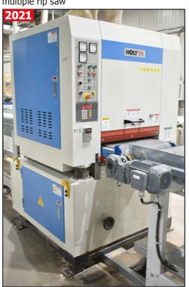
HOLYTEK BKM-2583DT 24" wide belt sander