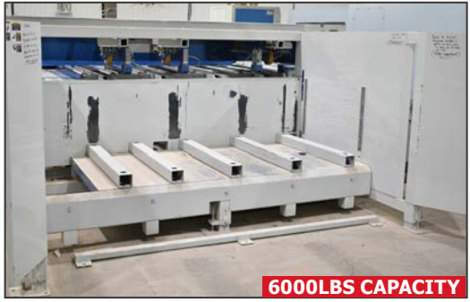
MEKANIKA NG-001 hydraulic scissor lift table