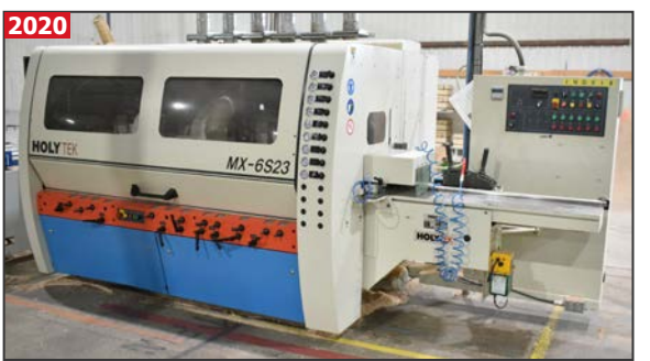
HOLYTEK MX-6S23 6-head side moulder