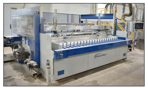
MEKANIKA NG-014 sander infeed transfer system