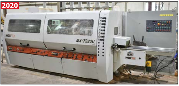
HOLYTEK MX-7S23U 7-head moulder