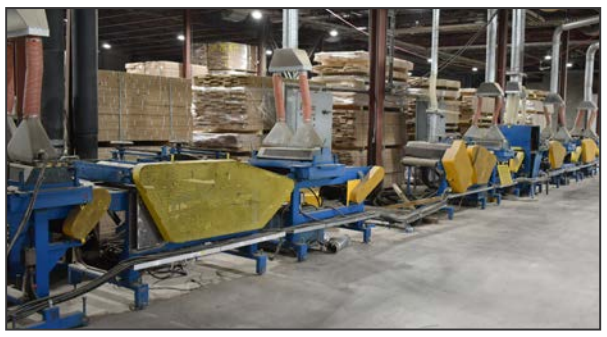
Finished veneer application line

OSAMA (2020) CLR-M3-400 3-section automatic rotary laminator/calender sheet roller press with 15.7" wide capacity, (6) 11.8" dia. rolls, 0"-100" adjustable working passage height, speeds 16-80 mt/min, 35" work surface height, S/N: 8758