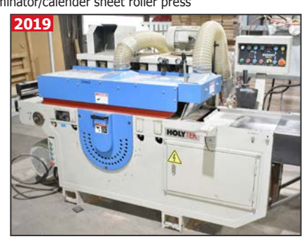
HOLYTEK GRS300A multiple edger