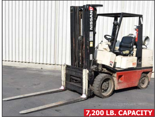
7,200 LB. CAPACITY