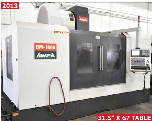
AWEA BM-1600 CNC vertical machining center