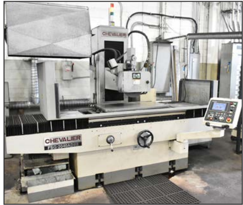
CHEVALIER FSG-2040 ADIII CNC hydraulic surface grinder