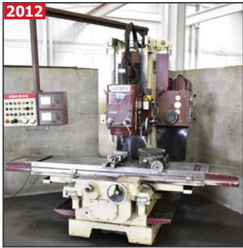
FORTWORTH VBM-5VHL universal milling machine