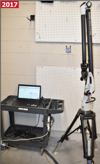
2017 HEXAGON METROLOGY ROMER ABSOLUTE ARM RA-7335SEI-4 portable arm CMM