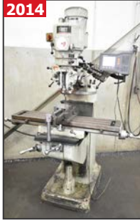
2014 FIRST LC1-1/2VS milling machines