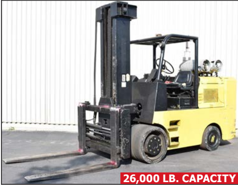
26,000 LB. CAPACITY