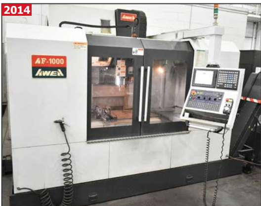
AWEA AF-1000 CNC vertical machining center