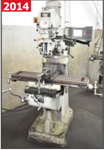
2014 FIRST LC1-1/2VS milling machines