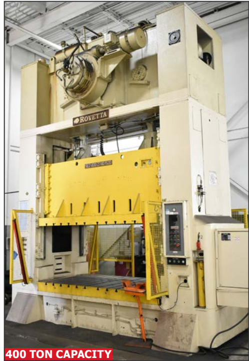
400 TON CAPACITY

ERFURT 4-point straight side stamping press