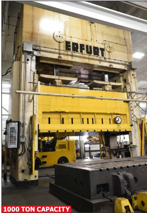
1000 TON CAPACITY

ERFURT 4-point straight side stamping press