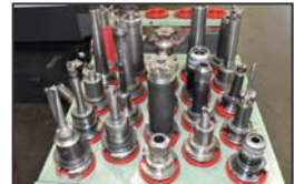
Partial view of tooling available