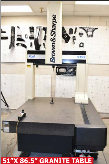
51"X 86.5" GRANITE TABLE