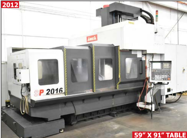
AWEA SP-2016 CNC bridge type vertical machining center