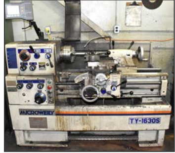
MICROWEILY TY-1603S gap bed engine lathe