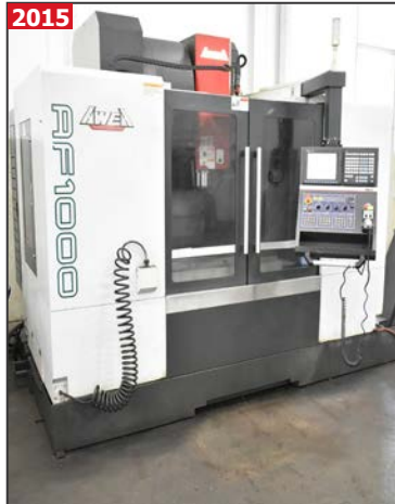
AWEA AF-1000 CNC vertical machining center