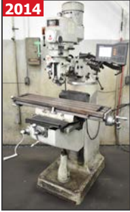
2014 FIRST LC1-1/2VS milling machines