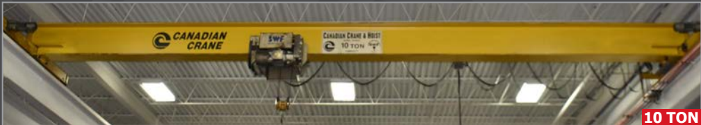
CANADIAN CRANE 10-ton single girder top running bridge crane