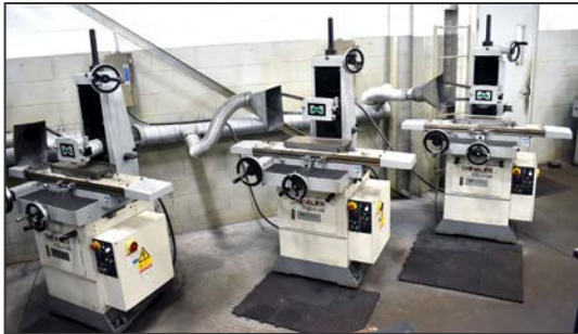
CHEVALIER FSG-618M manual surface grinders