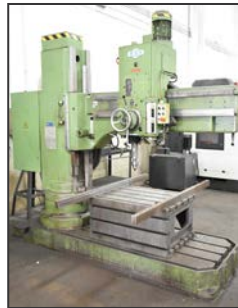
MAS VO50 5' way type radial arm drill