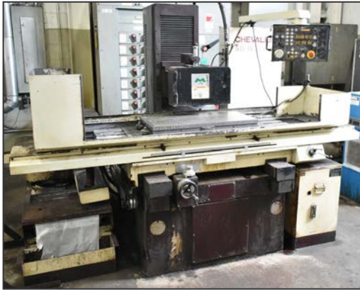
CHEVALIER FSG-1632 ADII automatic hydraulic surface grinder