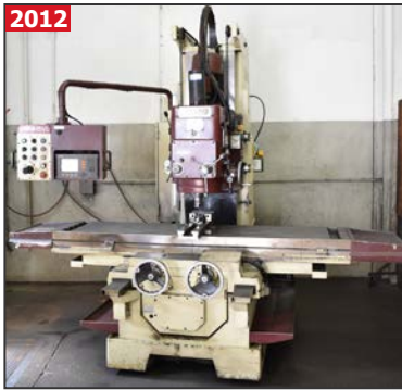
FORTWORTH VBM-5VL vertical milling machine