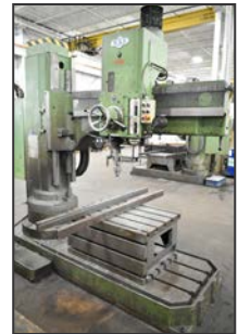
MAS VO50 5' way type radial arm drill