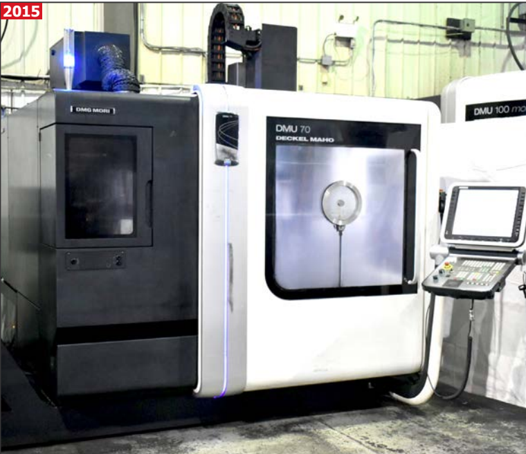
DMG DMU 70 NEW DMG DESIGN 5-axis high speed universal machining center