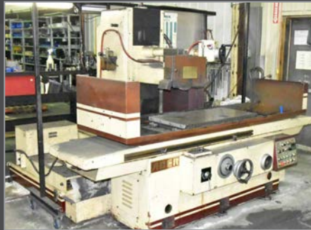
ACER 2040AHD hydraulic surface grinder