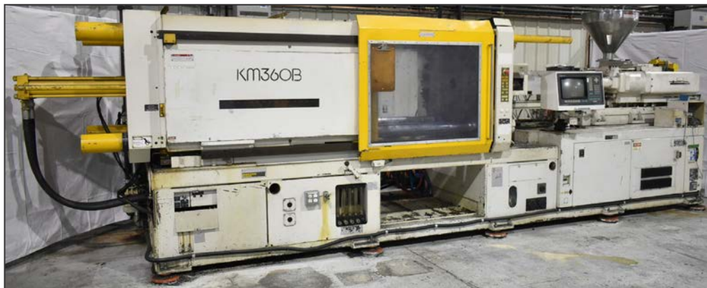
KAWAGUCHI KM360B horizontal hydraulic injection molding machine