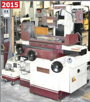
2015 ACER SUPRA-818AII hydraulic surface grinder