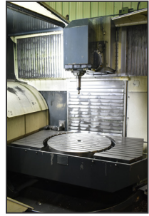
DMG DMU 100 MONOBLOCK 5-axis high speed universal machining center