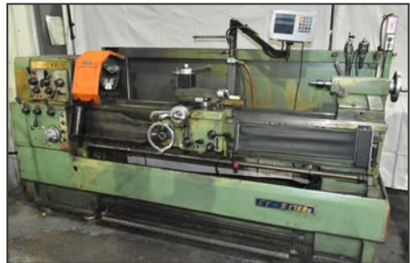
CY DRUMMOND CY-S1760G gap bed engine lathe

TO SCHEDULE AN AUCTION CONTACT 416.962.9600