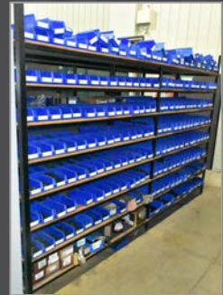
Partial view of hardware available

THIS IS A PARTIAL LISTING ONLY! FOR FURTHER INFORMATION, PLEASE VISIT WWW.CORPASSETS.COM