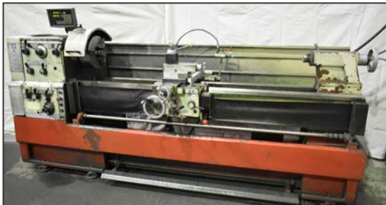
LEBLANC gap bed engine lathe