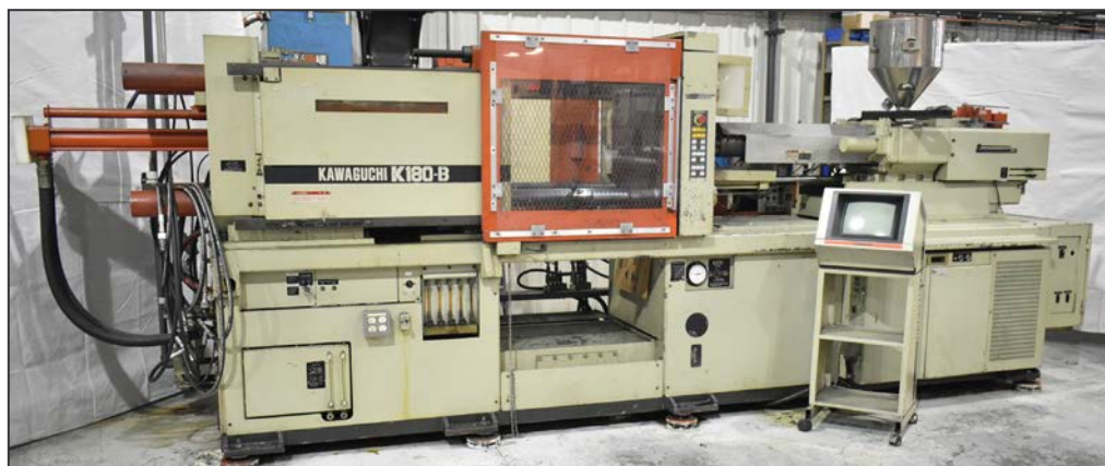
KAWAGUCHI K 180-B horizontal hydraulic injection molding machine