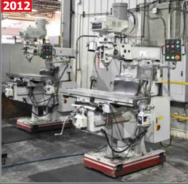
2012 SOUCO FM-5V vertical turret milling machines

Tuesday, September 10 Sainte-Foy, Quebec, Canada