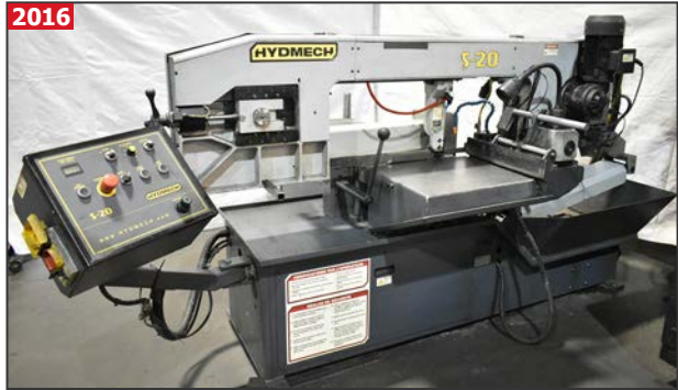
2016 HYDMECH S-20 horizontal pivot band saw