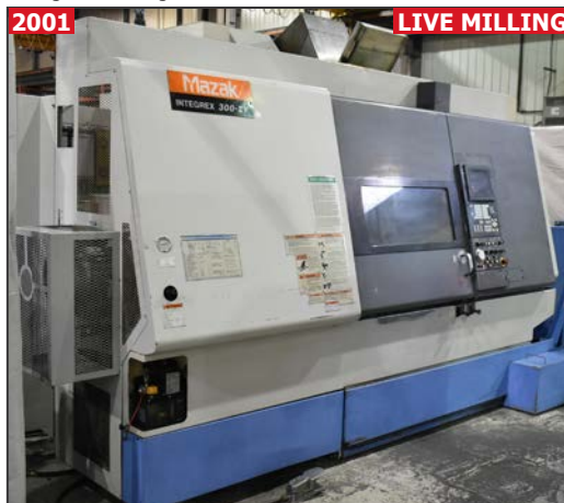
MAZAK INTEGREX 300-2Y CNC multitasking live milling and turning center