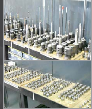
Partial view of tooling available