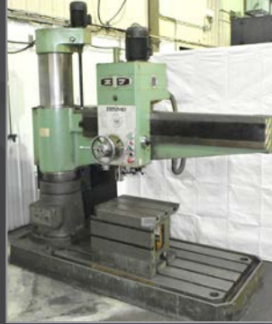
ZJ SHENGYANG Z3050X16(i) 5' radial arm drill