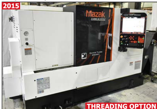
MAZAK QUICK TURN 250 MY 20"/500U CNC multitasking live milling and turning center