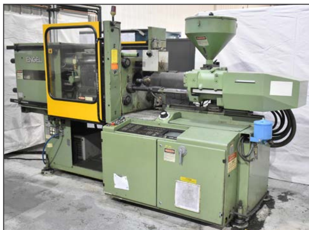
ENGEL ES 330/80 horizontal hydraulic injection molding machine