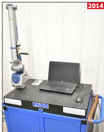
FARO EDGE E-09 portable 6-axis CMM arm

CONTACT 416.962.9600 TO CONSIGN EQUIPMENT AT AN UPCOMING AUCTION