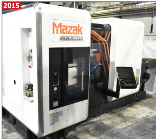
MAZAK INTEGREX i-200 40"/1000U CNC multitasking live milling and turning center