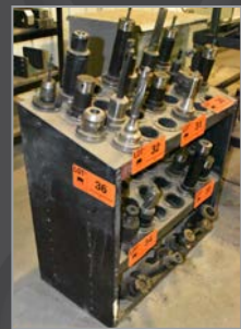
Partial view of tooling available

ALSO: Large assortment of CAT 50 tool holders, machining fixture attachments, shop support equipment, tables, cabinets, shelving, power tools, inspection equipment, office furniture and more.