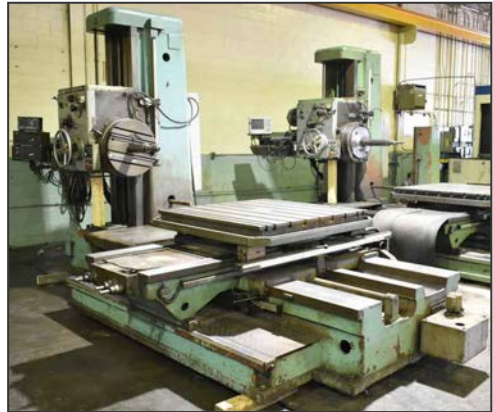
TOS W100A table-type horizontal boring mill