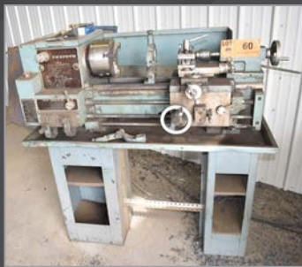
ACKLANDS FREJOTH F1560 tool room lathe