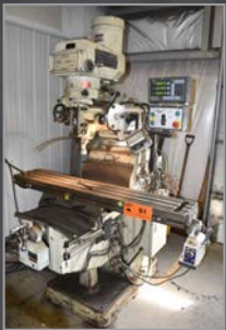
MFG UNKNOWN vertical turret mill