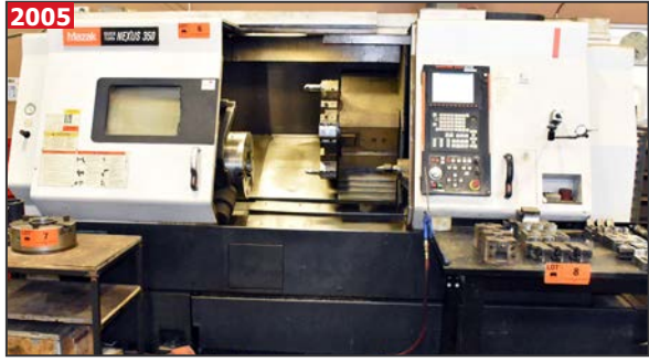
2005 MAZAK QUICK TURN NEXUS 350 CNC turning center