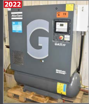
2022 ATLAS COPCO GA11FF rotary screw tank mounted compressor