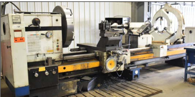
SUMMIT 52-6x160B gap bed engine lathe