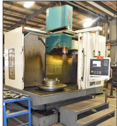
LELILY INDUSTRIAL COMPANY SUPER DRILL SUPE-1000F vertical CNC drill