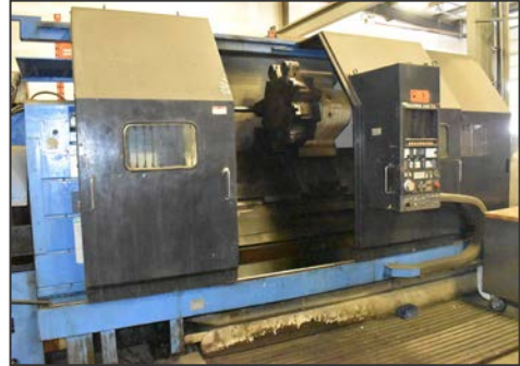
MAZAK SLANT TURN 50N CNC turning center