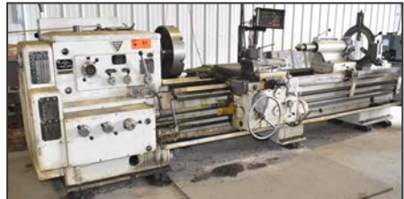
STANKO 1M63B lathe