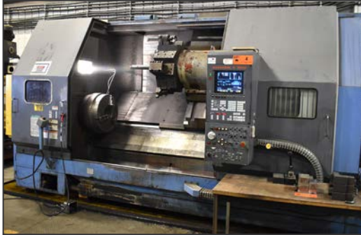
MAZAK SLANT TURN 50N CNC dual chuck turning center