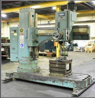
MAS 6' way type radial arm drill