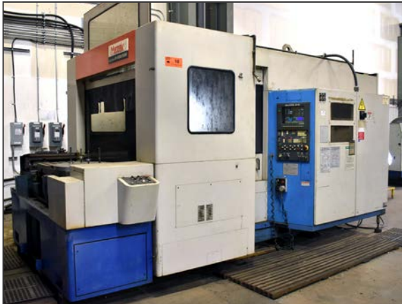
MAZAK MAZATECH H-500/50N twin pallet CNC horizontal machining center