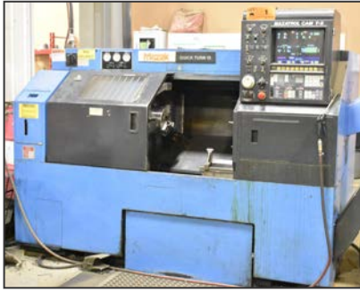
MAZAK QUICK TURN 15 CNC turning center