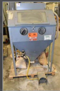
TRINCO dry blast sandblast cabinet