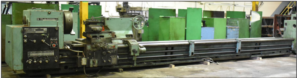
TOS SU125 engine lathe