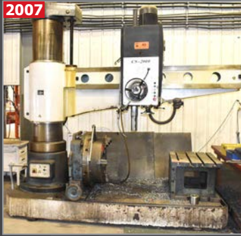
2007 SMTCL CS-2000 7' radial arm drill