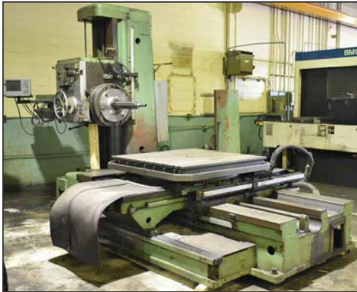
TOS W100A table-type horizontal boring mill