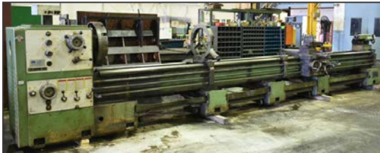
MERLI CLOVIS MODEL 28 gap bed engine lathe