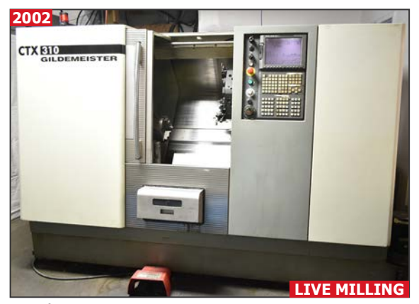
DMG / GILDEMEISTER CTX310 turning center