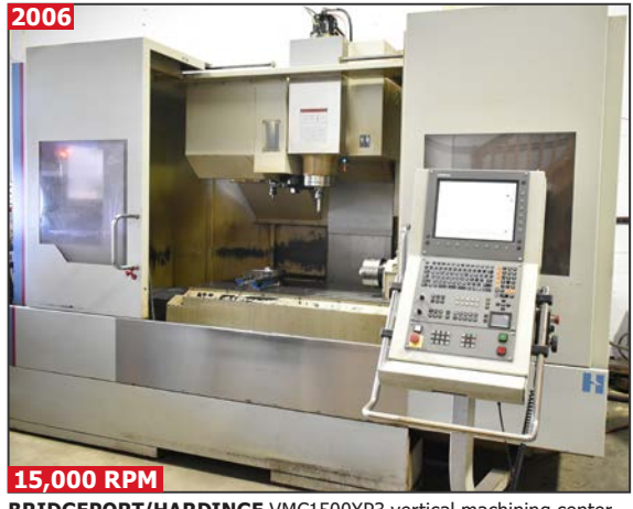
BRIDGEPORT/HARDINGE VMC1500XP3 vertical machining center