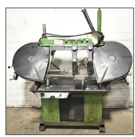
RAM horizontal band saw