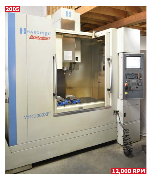
BRIDGEPORT/HARDINGE VMC1000XP3 vertical machining center