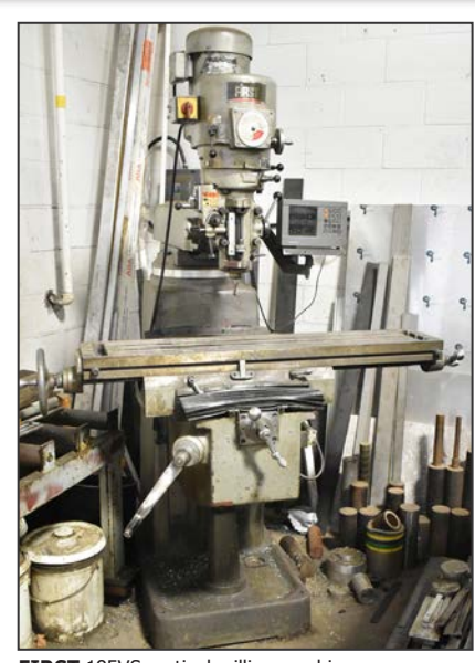
FIRST 185VS vertical milling machine