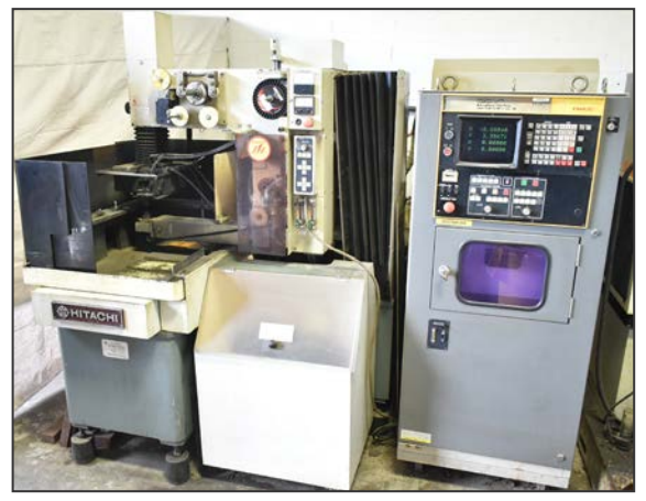
HITACHI HCUT 3040N wire type EDM