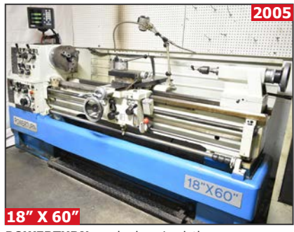
POWERTURN gap bed engine lathe