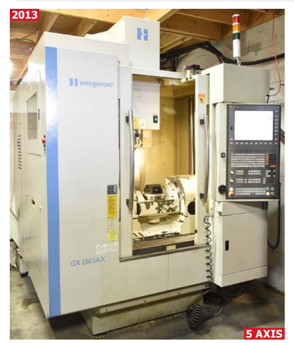
HARDINGE GX250 5AX 5 axis vertical machining center