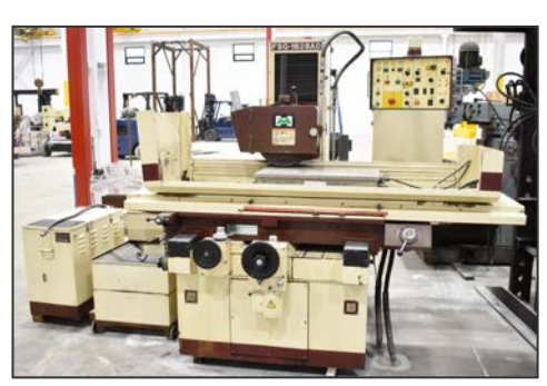
CHEVALIER FSG-1628 AD hydraulic surface grinder