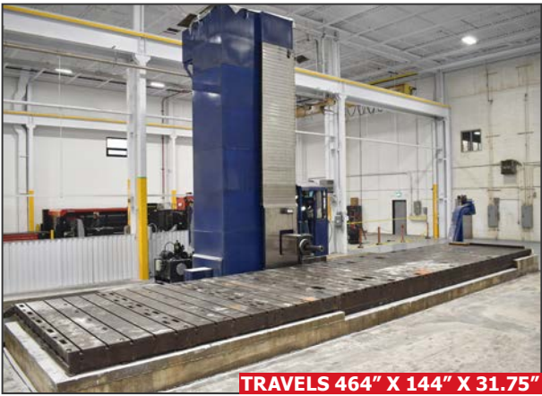
HOAYANG 6FBR6913 CNC floor-type horizontal boring mill