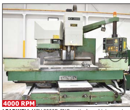
LEADWELL MCV-2000D CNC vertical machining center