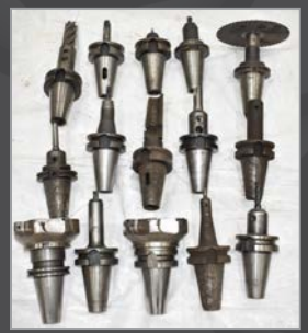
Partial view of CAT50 & BT50 tool holder available