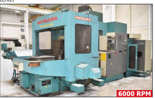
MATSUURA MC-900H-63-PC2S CNC twin-pallet horizontal machining center