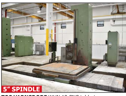
TOS VARNSDORF WHN 13 CNC table-type horizontal boring mill