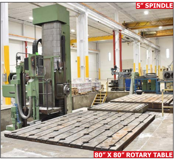
TOS VARNSDORF WPD 130 CNC floor-type horizontal boring mill