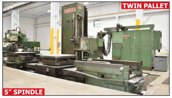
BERARDI 5" modular table-type horizontal boring mill