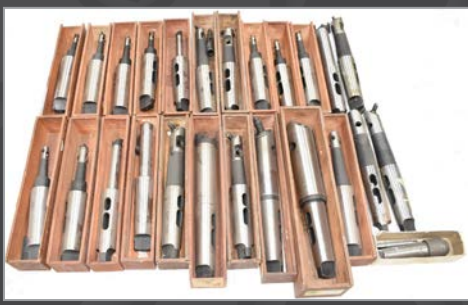
Partial view of tooling available

ALSO: LARGE QUANTITY of CAT50 & BT50 tooling; MACHINE ACCESSORIES including: right-angle boring mill heads, universal boring mill head, spindle supports/extensions and MORE!