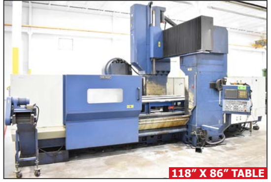
NU-WAY SIGMA SDV-3224 CNC bridge-type vertical machining center