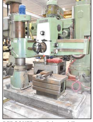
BERGONZI 4' radial arm drill