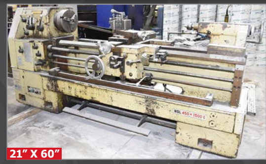
NAMSUN NSL450-1500 gap bed engine lathe