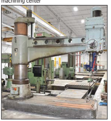
HAVLIK Z3080X25 8' radial arm drill