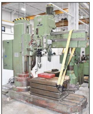
MAS V050 6' radial arm drill