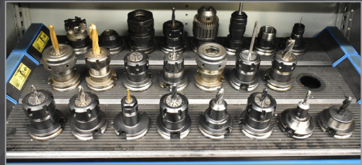
Partial view of tooling and accessories available

FEATURING: HAAS (2005) VF-3B CNC vertical machining center; HAAS (2003) VF2S CNC vertical machining center; GILDEMEISTER (2002) CTX400 SERIES 2 CNC turning center; PROSTAR 6240 gap bed engine lath; FIRST LC-1 1/2 VS vertical mill; CHEVALIER FSG-618M surface grinder; MODEL 260 roll-in saw; YALE CLC060TGNUAE082 LPG forklift; CHICAGO PNEUMATIC (2016) QRS7.5HPD air compressor & MORE!