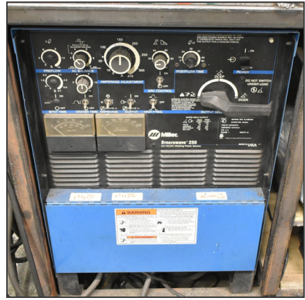
MILLER SYNCROWAVE 250 mig welding power source