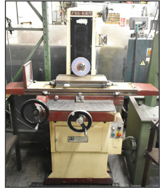
CHEVALIER FSG-618M surface grinder