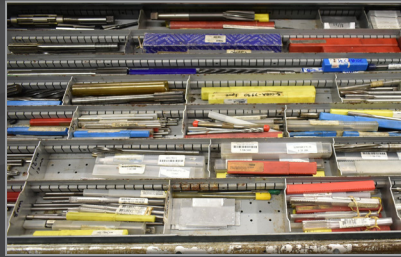
Partial view of tooling and accessories available