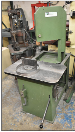
MODEL 260 roll-in saw