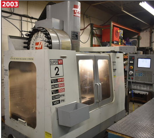
HAAS VF2S CNC vertical machining center