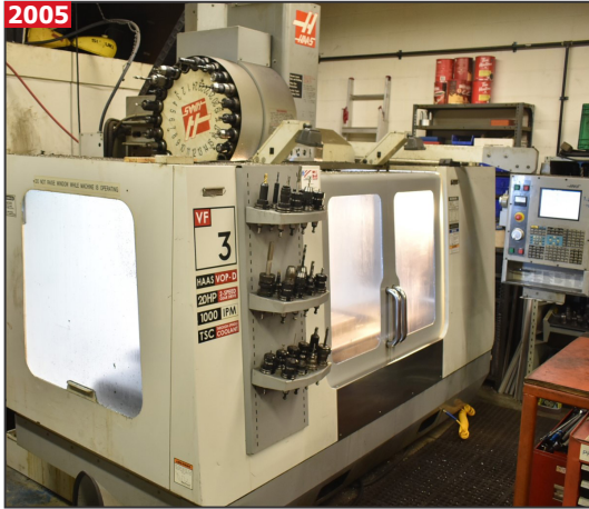
HAAS VF-3B CNC vertical machining center