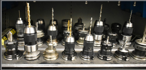
Partial view of tooling and accessories available