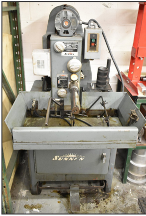
SUNNEN MBB-1160 2HP honing machine