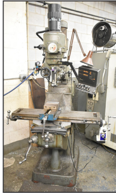
FIRST LC-1 1/2 VS vertical mill