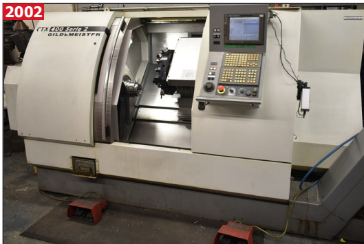
GILDEMEISTER CTX400 SERIES 2 CNC turning center