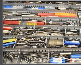
Partial view of tooling and accessories available