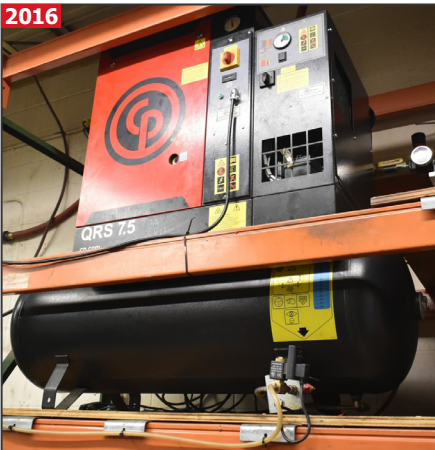
CHICAGO PNEUMATIC QRS7.5HPD air compressor