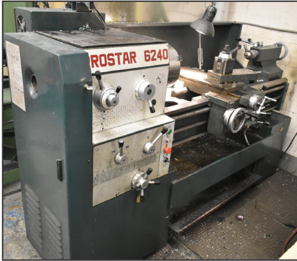
PROSTAR 6240 gap bed engine lathe