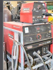
LINCOLN ELECTRIC CV305 ARC welder