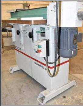
DOUCET PMC-150 6" x 108" belt sander