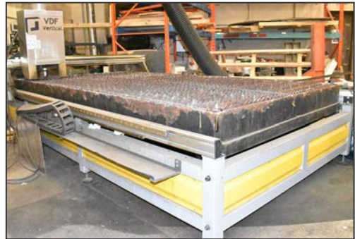
HUGONG INTECUT-S plasma cutting table