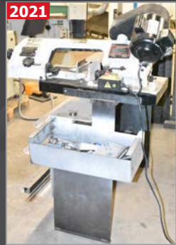
2021 CRAFTEX CX109 swivel metal cutting bandsaw