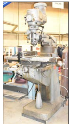
BRIDGEPORT milling machine

INSPECTION IS WEDNESDAY, DECEMBER 4 FROM 9 AM TO 4 PM.