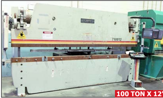
100 TON X 12'