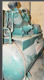
CHAMPION air compressor