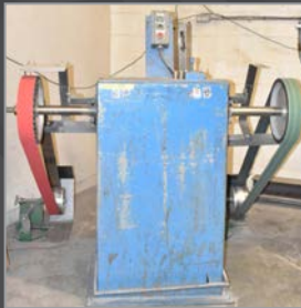
MFG UNKNOWN 3" X 132" double end belt sander