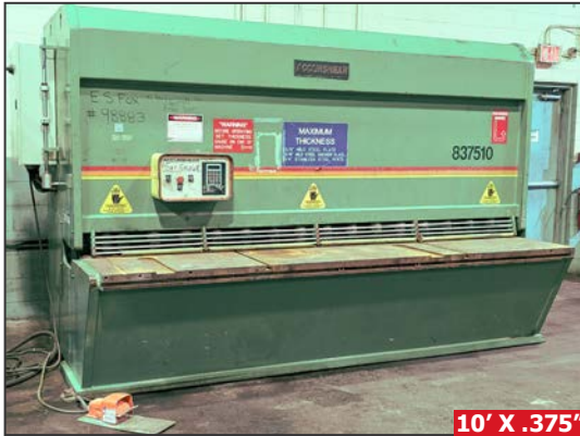
10' X .375"