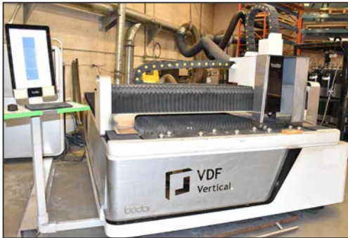
BODOR F3015 CNC fiber laser cutting machine