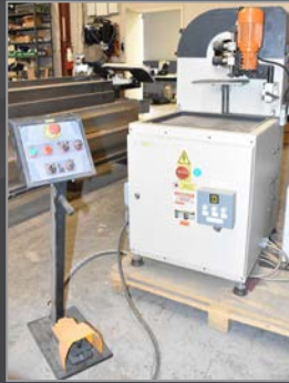
SAHINLER BT114S tube/pipe polishing machine