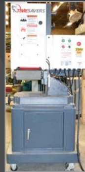
TIMESAVERS MINIBELT belt sander