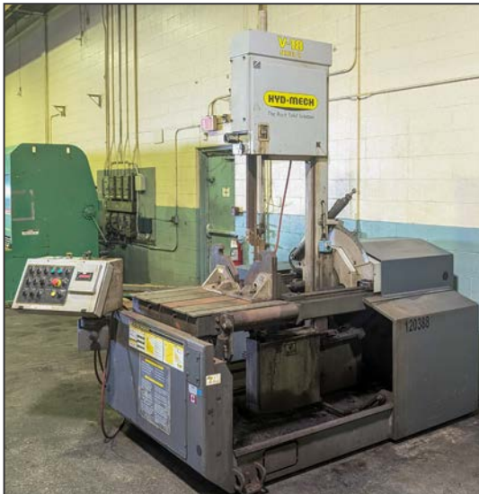
HYD-MECH V-18 SERIES II semi-automatic tilting frame vertical band saw