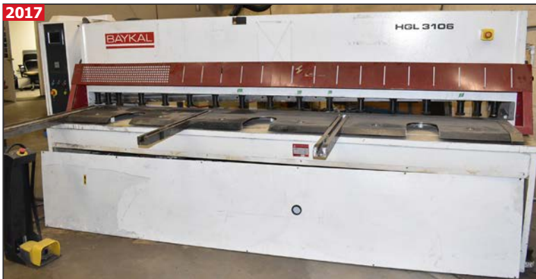
BAYKAL HGL 3106 CNC 10' hydraulic shear