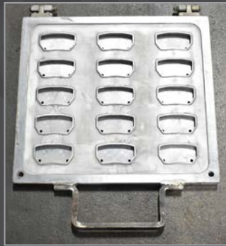
Partial view of dies available