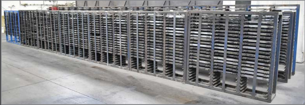
Partial view of dies available