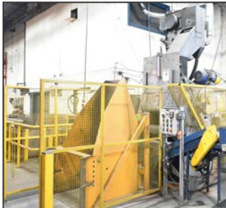
PROTEC CIC TUMBLE BLAST automatic tumble blast machine