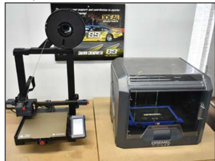
Partial view of DREMEL 3-d printers available