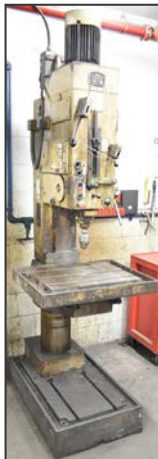
WMW BS4AI gear head drill