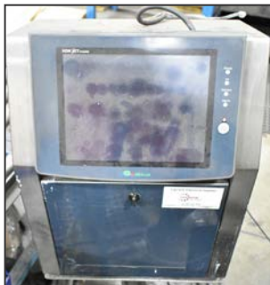
GKG JET CCS-3000PS inkjet coder