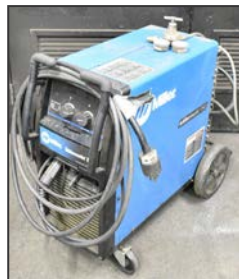
MILLER MILLERMATIC 252 digital MIG welder