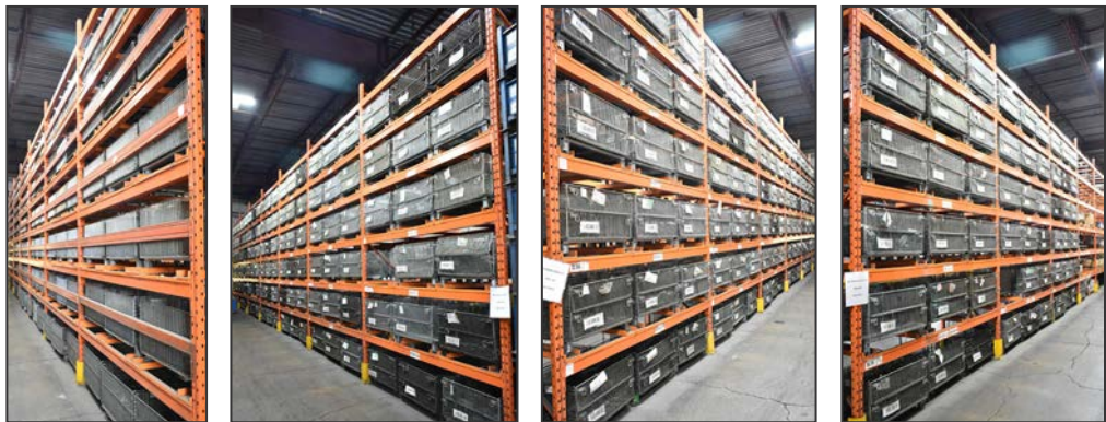
(42) sections of 9' L x 42" W x 16' H heavy duty adjustable pallet racking