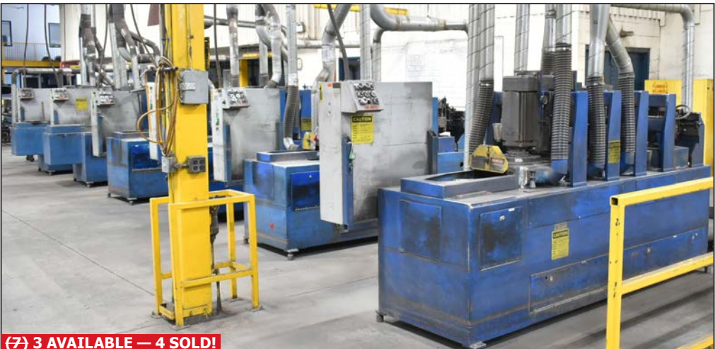
View of multi platen curing presses