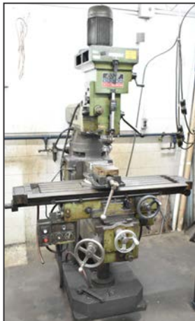
ROSSI V01 vertical turret milling machine