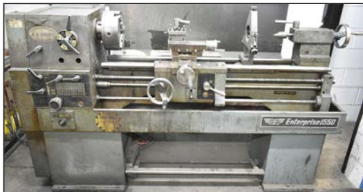
MK ENTERPRISE 1550 gap bed engine