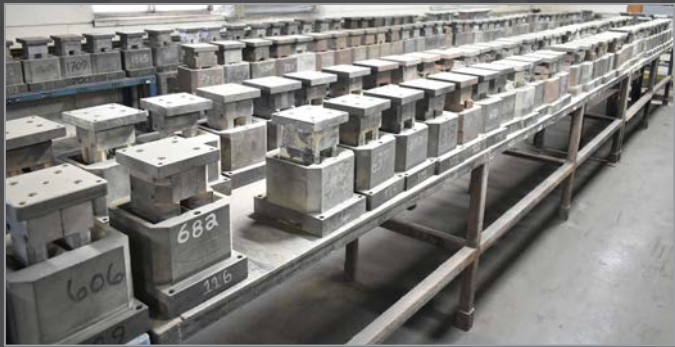
Partial view of dies available

THIS IS A PARTIAL LISTING ONLY! FOR FURTHER INFORMATION, PLEASE VISIT WWW.CORPASSETS.COM