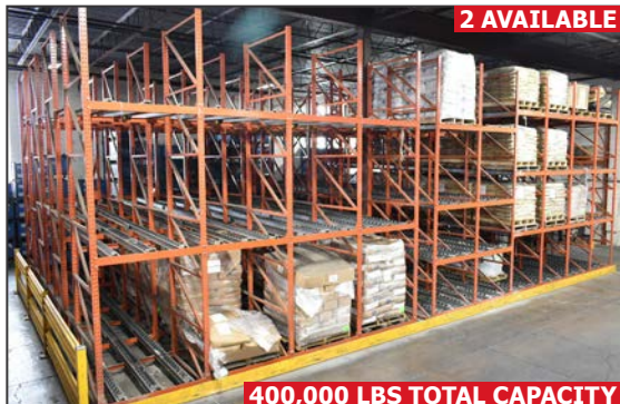
KONSTANT flow through type selective pallet rack storage system