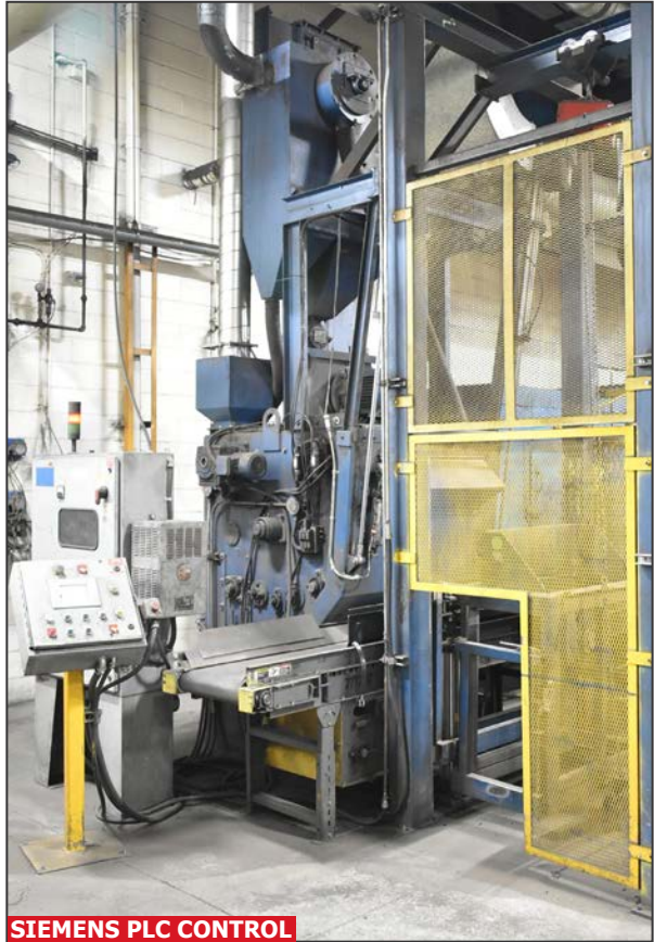
SIEMENS PLC CONTROL