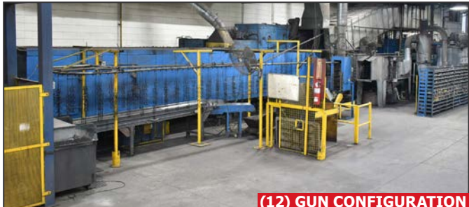
(12) GUN CONFIGURATION