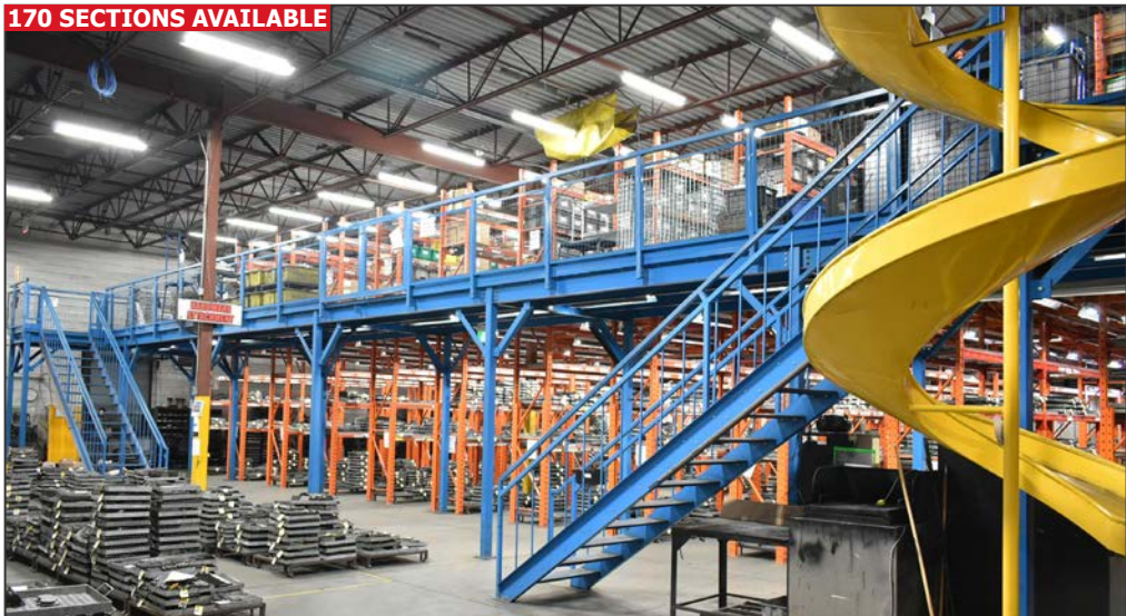
REDI-RACK/KONSTANT 18-bay flexible storage structure