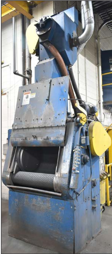
WHEELABRATOR TB#12 tumble blast machine w/ SIEMENS SIMATIC touch screen PLC controls