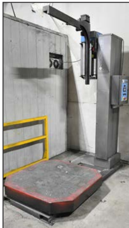
COUSINS HP2100X-A automatic pallet wrapper