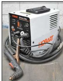
HOBART portable plasma cutter