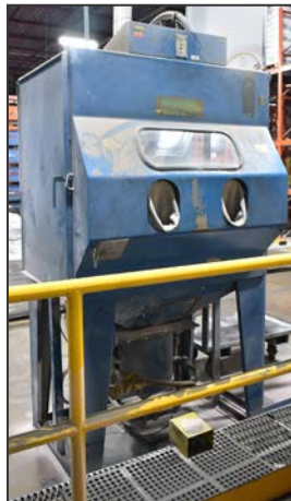
MAXIBLAST MB483648P/DC100 sandblasting cabinet