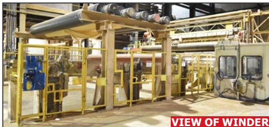
VIEW OF WINDER