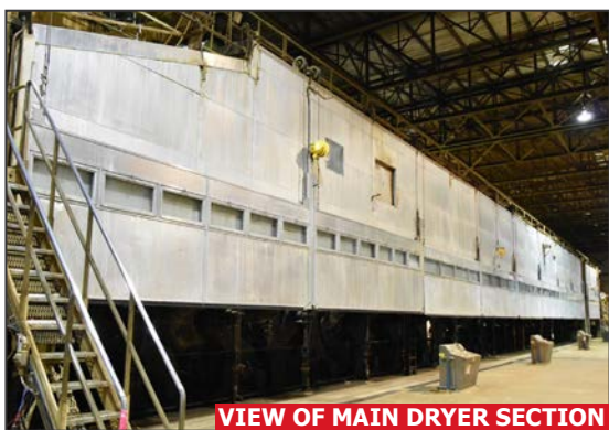
VIEW OF MAIN DRYER SECTION