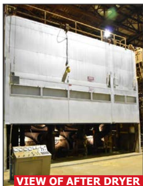
VIEW OF AFTER DRYER