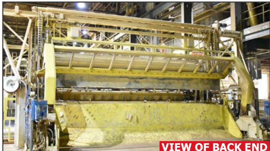
VIEW OF BACK END