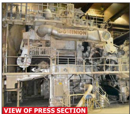
VIEW OF PRESS SECTION