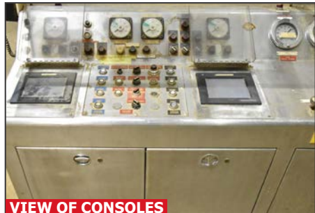
VIEW OF CONSOLES