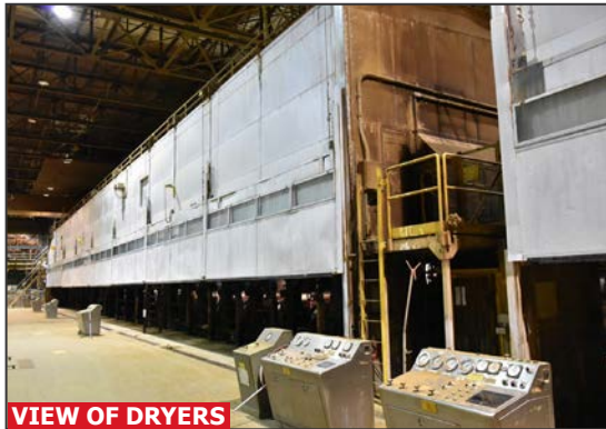
VIEW OF DRYERS