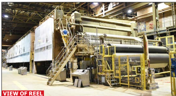
VIEW OF REEL

CONTACT 416.962.9600 TO CONSIGN EQUIPMENT AT AN UPCOMING AUCTION