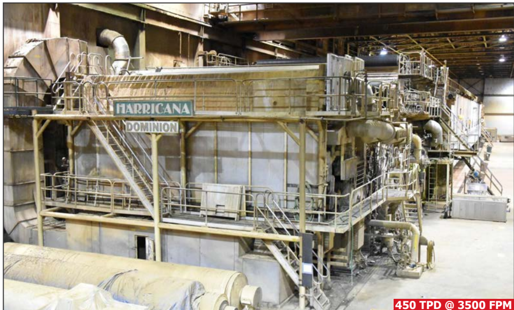
450 TPD @ 3500 FPM